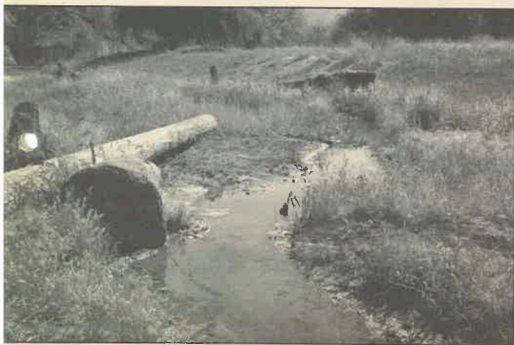
Habitat Enhancement - Conifer logs, stumps and large boulders were placed within the new channel to enhance fish and wildlife habitat.

During 1998 various trees were planted throughout the new channel