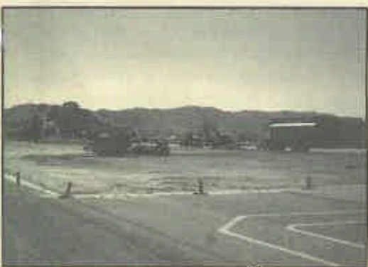
The construction in the taxiway area included new rock base material and 3.5" of asphalt paving.

Visitors to the Roseburg Regional Airport may have noticed that portions of the airport received a much needed face-lift this past summer. Thanks to a $1.3 million FAA grant, much of the asphalt surface has been replaced. Other improvements constructed as part of this project included new signage and lighting along the runway and taxiway, new storm drainage facilities, updated obstruction lighting on Mount Nebo, and new fencing and entry gate along the west side of the airport. The Federal Aviation Administration administered the grant which paid up to 90% of the engineering and construction costs. The 10% matching funds were provided by the City through Urban Renewal, Economic Development and Utility funds.