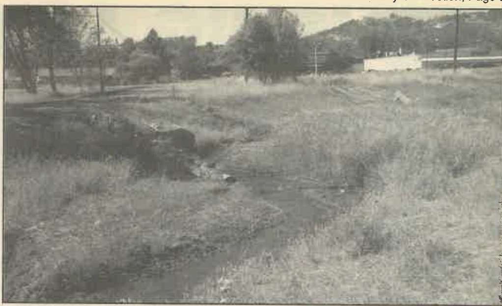
New Channel - Newton Creek's new meandering channel and wide flood way was constructed where Valley View Drive once was as part of the Garden Valley Boulevard and Stewart Parkway intersection reconstruction project.

and the fish habitat logs were replaced. Irrigation and additional planting will be installed in early 1999. The Parks Department constructed a new nature trail connection through the area providing access to Stewart Parkway.