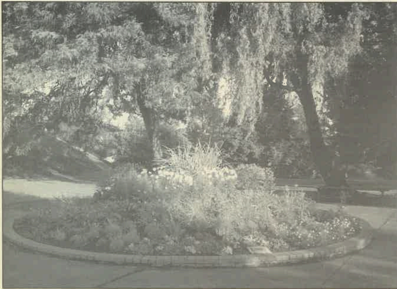
This planting area brightens up Riverside Park and welcomes people as they cross the Oak Street Bridge into Downtown Roseburg.

Our Roseburg Parks Department volunteer program has grown tremendously thanks in part to the enthusiastic support of many dedicated citizens. In 1998 over 3,000 hours of volunteer service by more than 300 people was much appreciated. Volunteers help our parks in many different ways, and the Parks Department volunteer program is designed to be flexible so any individual or group that wants to help is welcome.