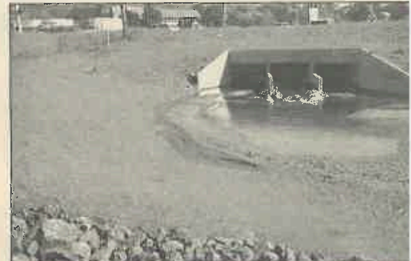
Large box culverts combine to carry Newton Creek under Garden Valley Boulevard.

Storm drainage fees are based around the "Equivalent Residential Unit" or ERU. This is the average amount of impervious surface area created by a single-family residence within the City of Roseburg. For ease in administration, this is the amount charged to every single-family residence within the City Limits. Currently the bimonthly charge for one ERU is $5.70. An ERU is equivalent to three thousand square feet. Industrial, commercial, and multi-family developments pay fees based on the square footage of the development. For example, a commercial development of 12,000 square feet would be charged 4 ERU's or $22.80 per billing period. Any commercial or industrial property that has more than sixty percent of the property developed is charged for the entire property.