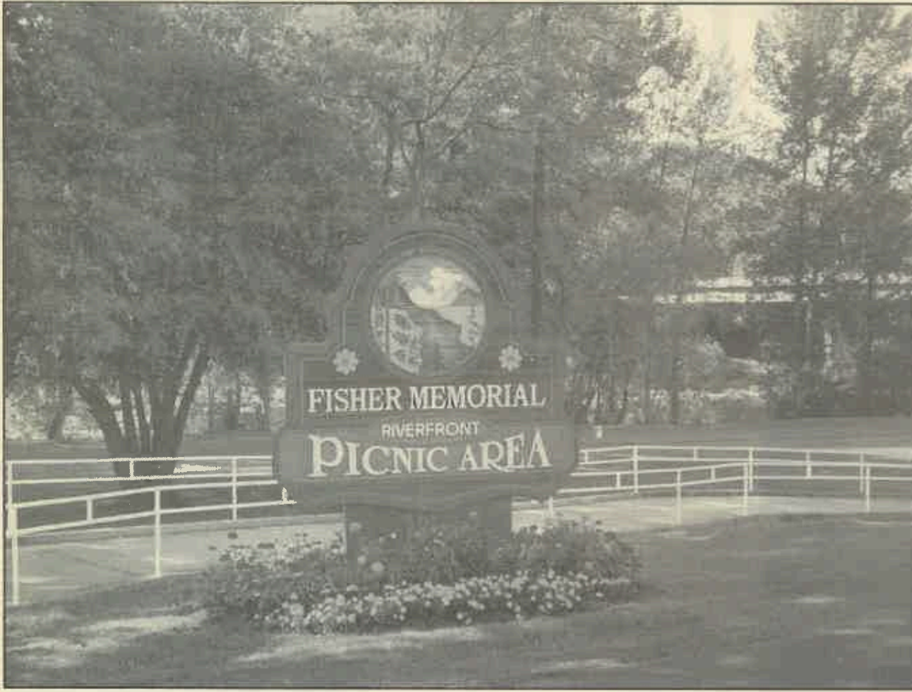
The sign and flowers welcome thousands of people to the wonderful Music on the Half Shell concert series each year.