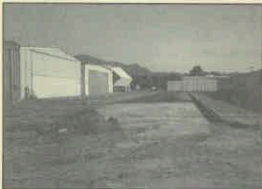
During the project, almost 700 cubic yards of dirt were removed and redistributed to make way for the Airport improvements.