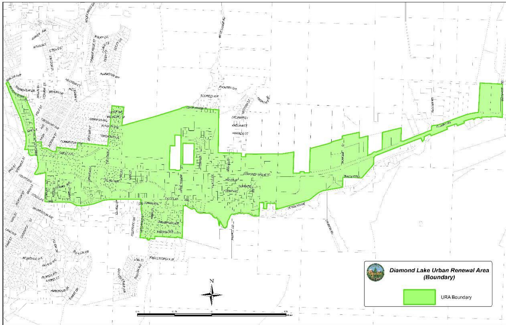
Figure 1 - Roseburg Diamond Lake Urban Renewal Area Boundary