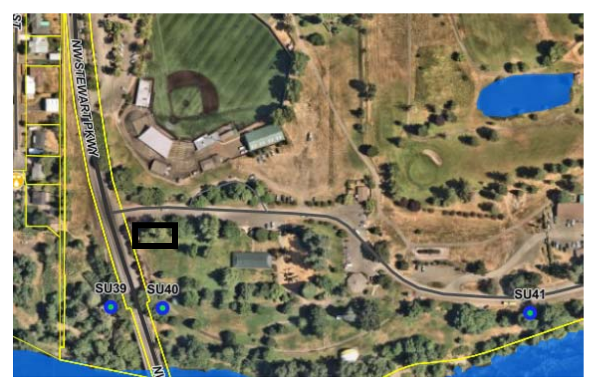
Fir Grove Assembly Area